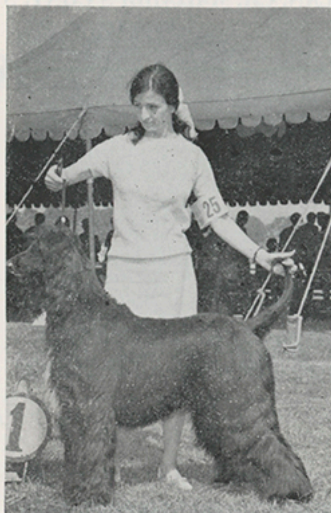
AKABA'S BRASS CINDER-ELLA

(Ch. Akaba's Top Brass ex. Ch. Akaba's Glacier Blue)