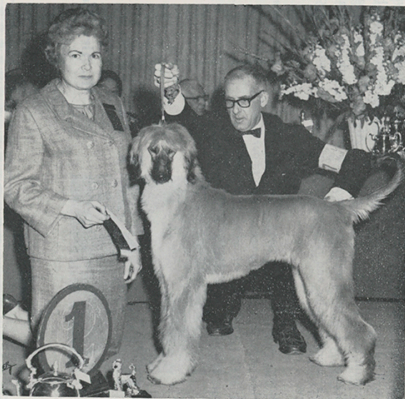
CH. GRAN SALAAM ECHO OF HOLLY HILL

"BEST PUPPY"—A.H.C. of A. SPECIALTY 1965 8 Months of Age