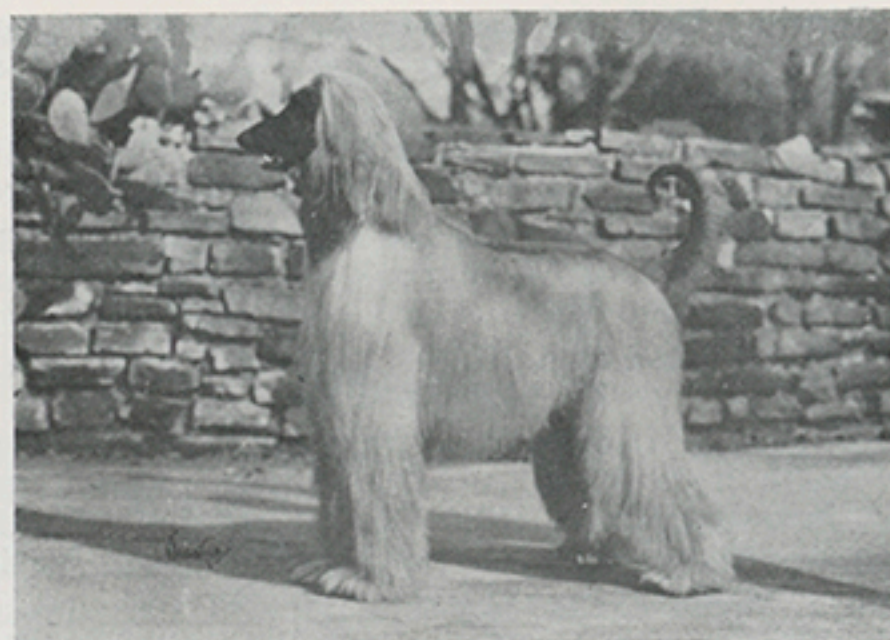
CH. DAHNWOOD GABRIEL