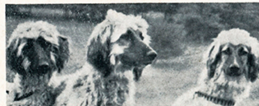
by CH. CROWN CREST RUBI X PINKY East Barnard, R.F.D. So. Royalton, Vt. Royalton 3-6271