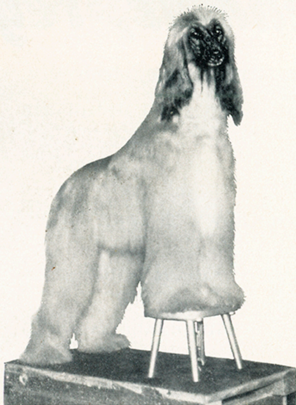
CH. CROWN CREST DEVIKKAROKIT, H-509480 (Red, black mask). Breeder: Kay Finch. Owner: Gertrude Curnyn