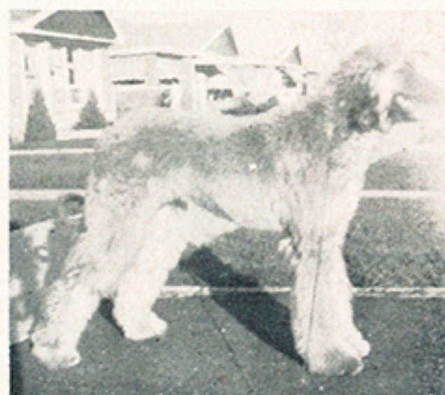
Kaheibar of Tajmir — 6 mos.