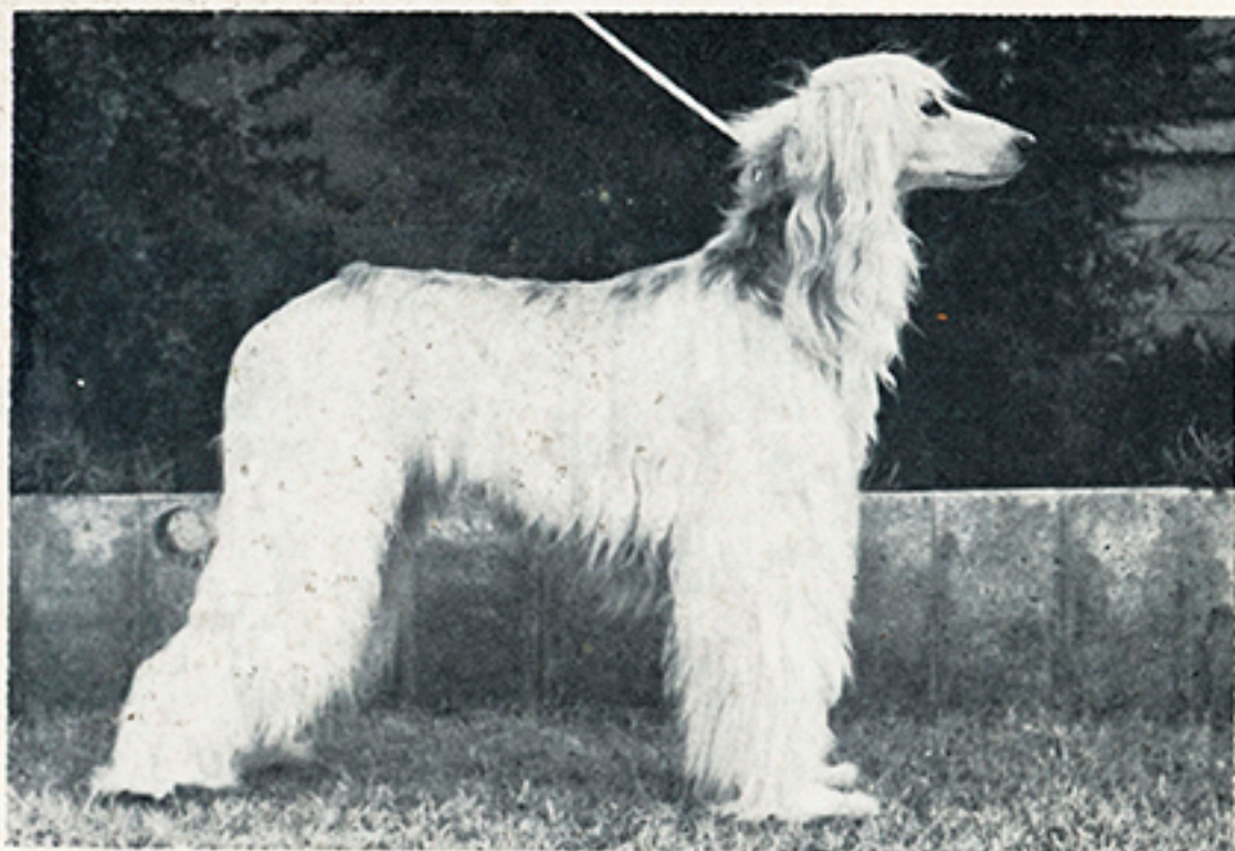
All Time World Record Holding Afghan Male

Norway, Sweden, Finland, Austria, Northern International CH. TANJORES DOMINO