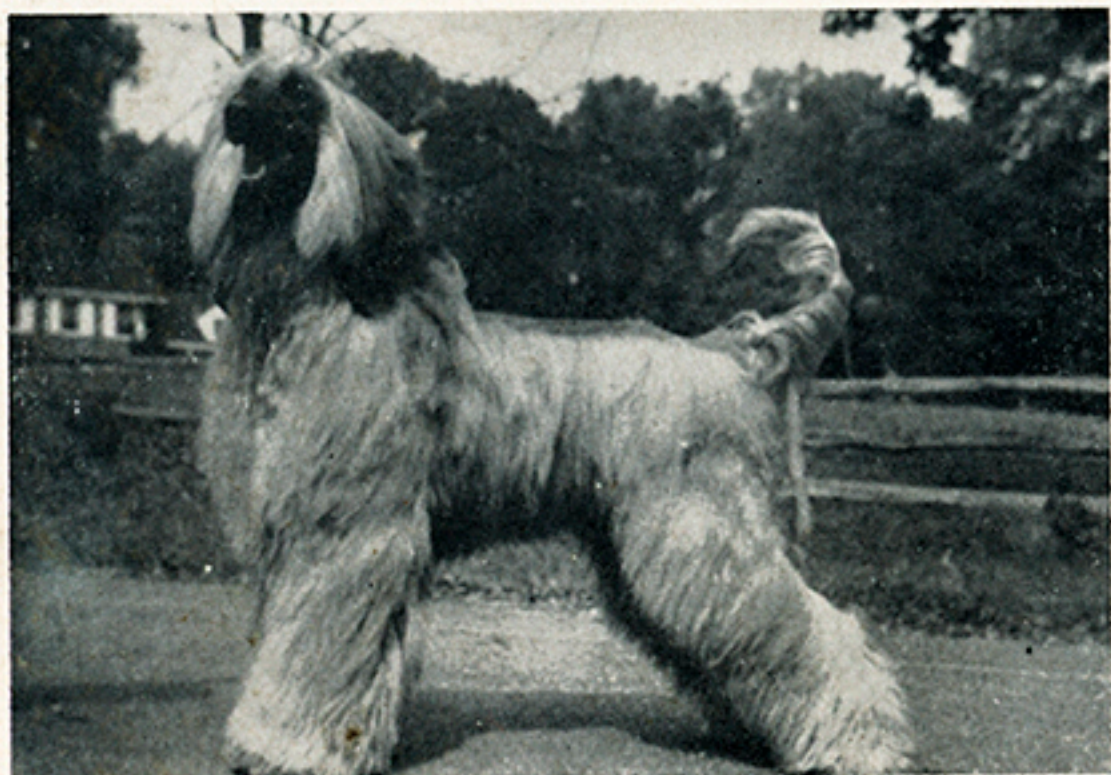
Ch. Hassen-Ben of Moornistan