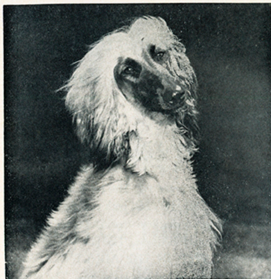
CH. CROWN CREST BABALOO, H-527566 (Red, black mask). Breeder: Kay Finch. Owner: Gertrude Curnyn