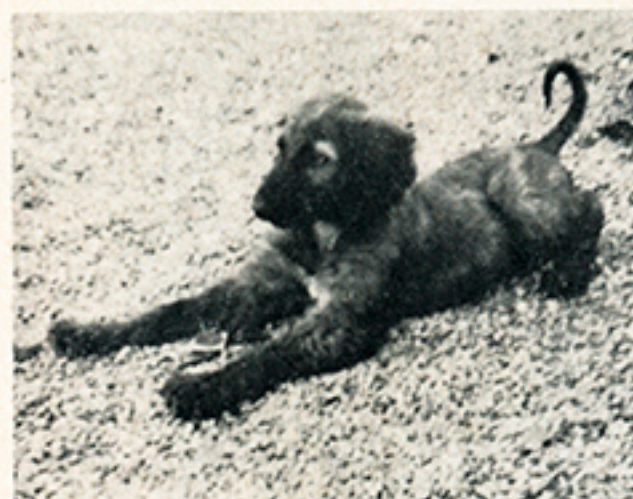
AKABA'S TOP BRASS "BRASSY"

Hi, here I am at 6 weeks, but you should see me now! The consensus of opinion is that I've grown up to be a real handsome lookin' Afghan. I just got second in a big Puppy Class at the Northern California A.H.C. Specialty at Golden Gate K.C., and won a real nice big trophy, so my mom is pretty pleased with me, BUT, that sister of mine, she really thinks she's something and she IS too! (Guess that's how she got her name). She just walked off with two big trophies at the same show. One for 1st in a big Puppy Class and THEN, lo and behold, she really taught the old gals a lesson in ring manners and showmanship and went on to RESERVE WINNERS BITCH! All this at 10 months of age! P.S. I just got a Reserve from Puppy Class too, at Lancaster K. C.