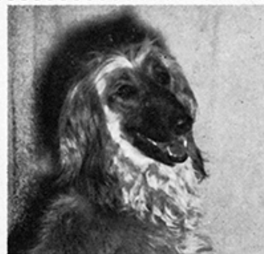
Tokalon's Ghrand Salaam