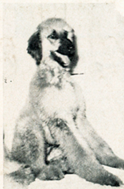
Zurashaddi at four mos.

A magnificent black masked litter sired by the BIS winner and great producer Ch. Majara Mihrab ex Nefer Nefer Tia of Grandeur