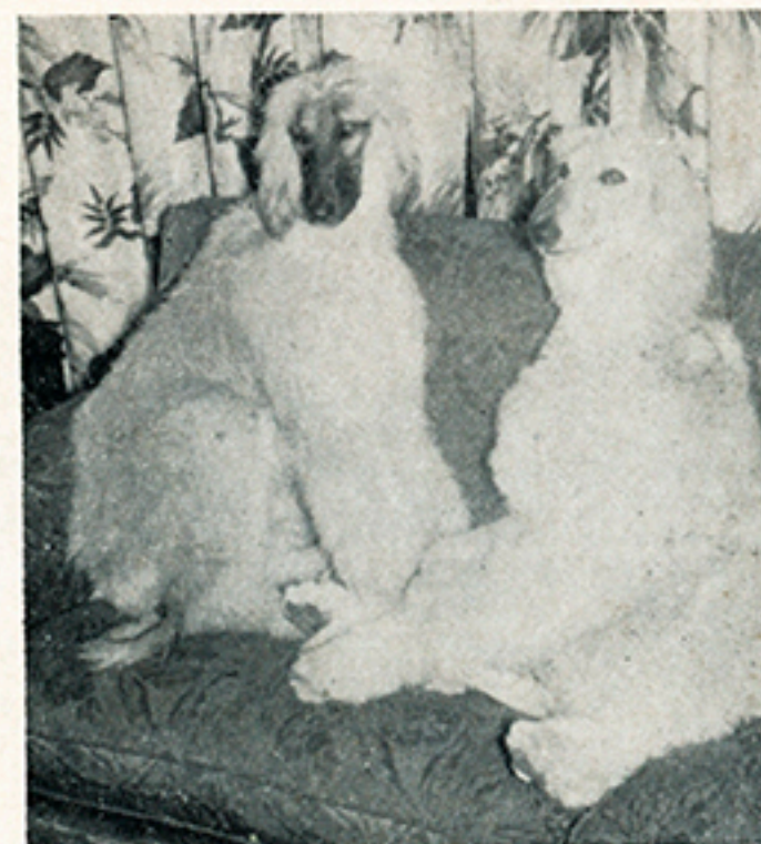
HARASHID'S SUKI, MAINE

Best Wishes from HARASHID "AFKIDS" from Maine to California