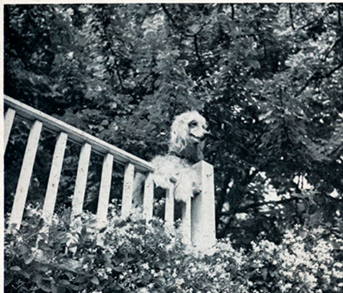
ALCARA'S ANTARES ( Free chile )

Our back porch hunter is gone. She lives on in our hearts, and in her progeny whelped August 2, 1958. Three of these adorable pixies, sired by Ch. Majara Maraud, are for sale.