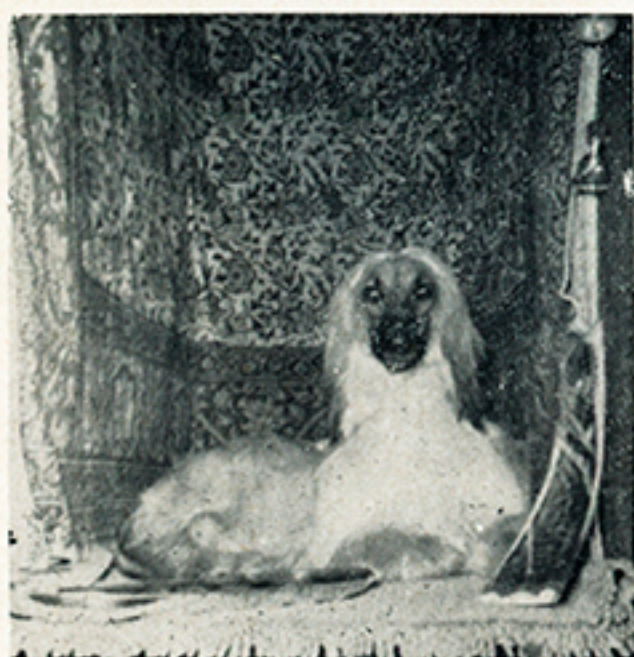
NEFER NEFER TIA OF GRANDEUR