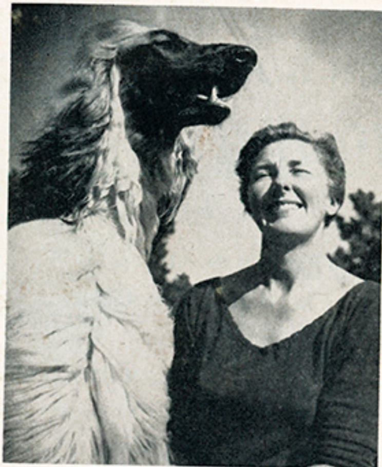
CH. CROWN CREST KABUL