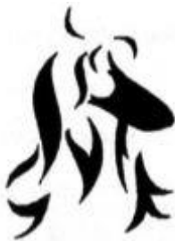
Potomac Afghan Hound Club