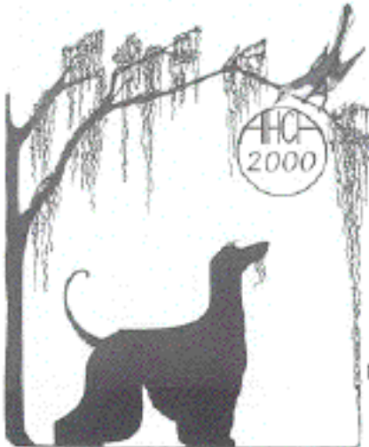
Listen To The Mockingbird