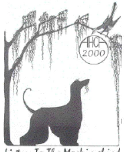
Listen To The Mochingbird