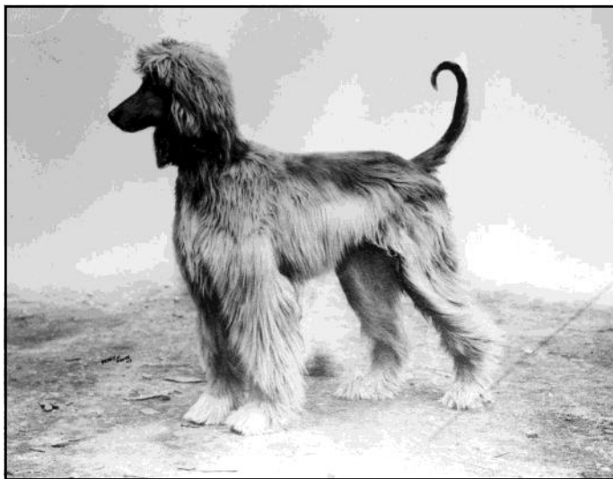
Rajah of Arken

We are researching prices to reprint Intro ; in the meantime, a single copy of the CD is available to individuals at no charge. Contact me at BeanieSue@aol.com or drop me a note at 61630 Toro Canyon Way, La Quinta, CA 92253. Once the booklet is reprinted we will send 10 copies to each Regional Club. Additional copies will be available at a minimal charge to clubs or individuals.