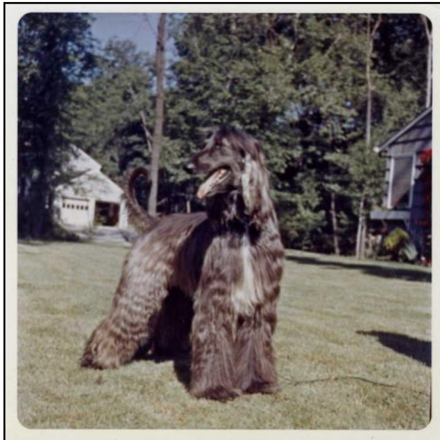
Shirkhan of Grandeur

If you haven't seen the breed information on the AKC website, please visit www.akc.org/breeds/afghan_hound