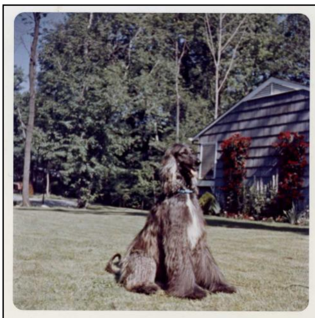
Shirkhan of Grandeur