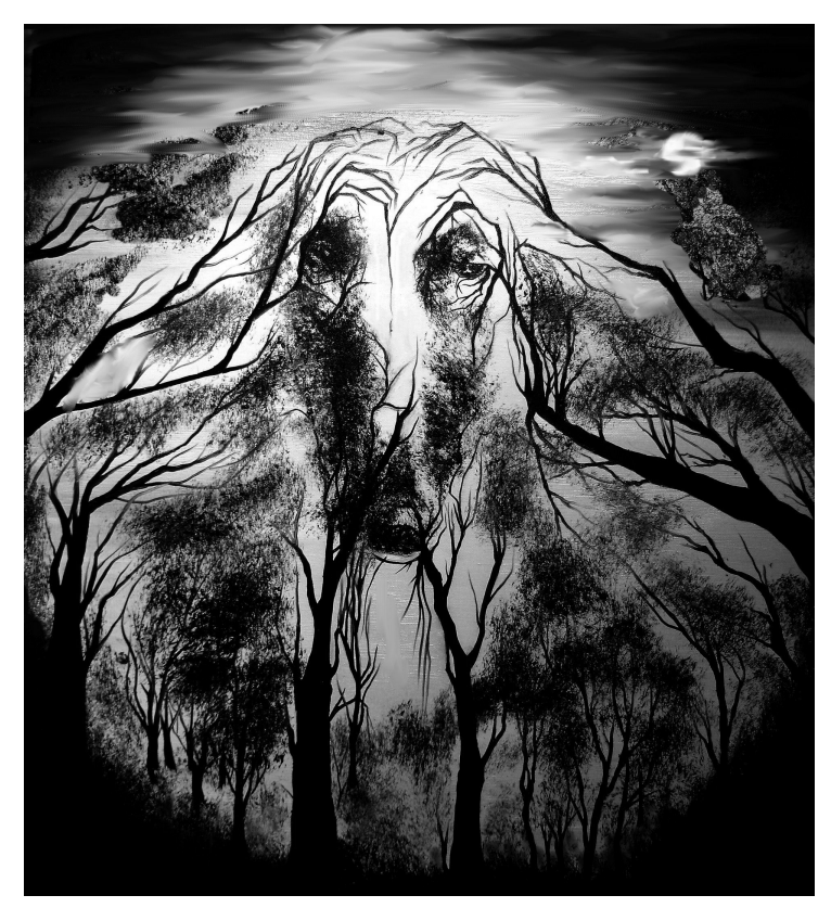
Mysterious Nights and Haunting Days in Lancaster, PA

Afghan Hound Club of America National Specialty 2009 Host Hotel Info September 13 - September 19, 2009