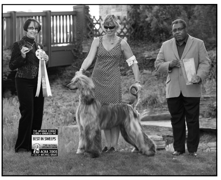
Best In Sweepstakes & Winners Dog

Best of Opposite Sex to Best in Sweepstakes -Mazshalna's Outlaw Torn Taji (6-9 Bitch) - this little girl for me was the epitome of an Afghan Hound puppy bitch. She had hair everywhere and moved with her head and tail up and had a wonderful outline and aloof attitude. Her dark eyes and expression looked down on the world around her and she didn't notice anyone else; the world was hers this day.