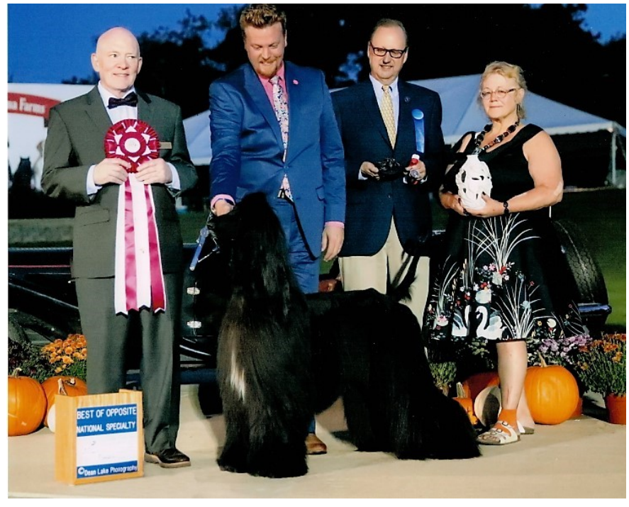
Best of Opposite Sex: GCh. Ecco Dragonfly's Apres La Pluie