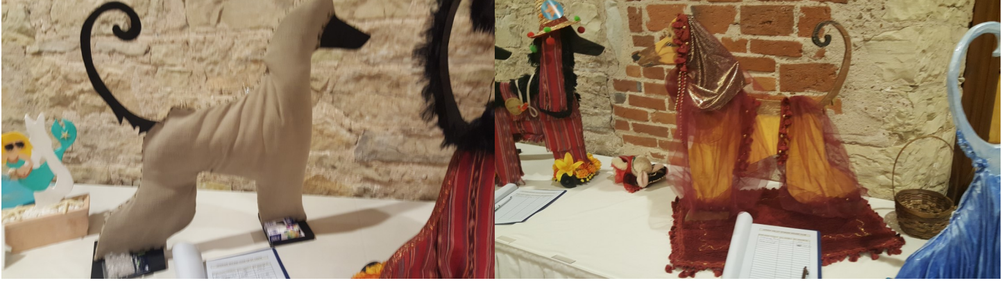
Lehigh Valley St. Louis