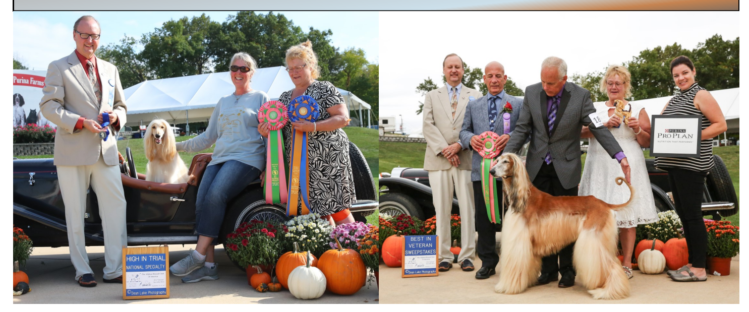
High In Agility Trial: I MACH Popovs Purrfection At Cayblu SC RE RATO