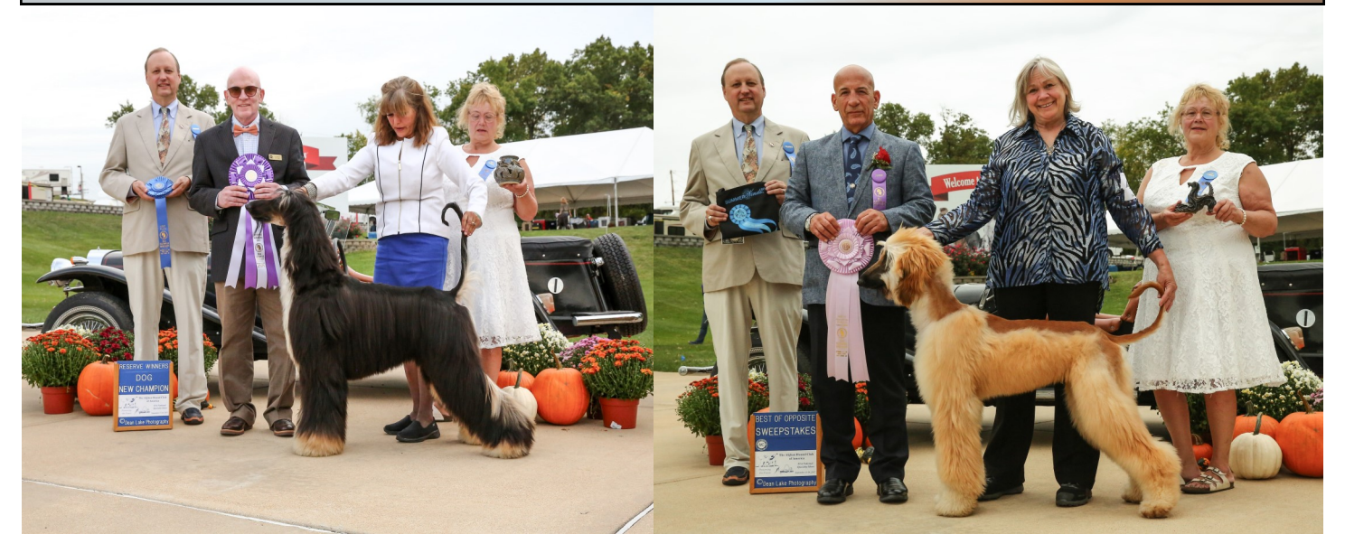
Reserve Winners Dog: Xenos Copper Nite Of Polo