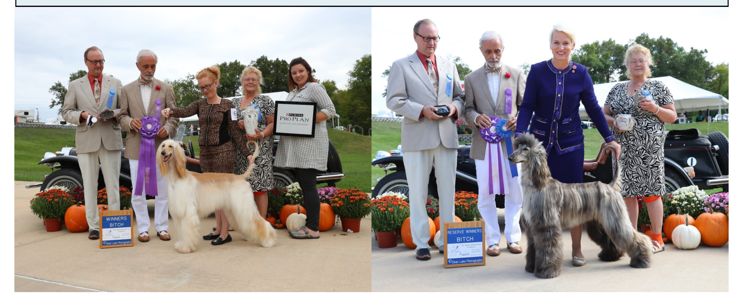
Winners Bitch: Jamna Winsong Martian Starlight At Anamcara

Editor's Note: Pictures of the remaining Awards of Merit GCh. Pahlavi Itz Not My First Rodeo and GCh.B Shylo Black And Blue All Over were not available from the photographer.