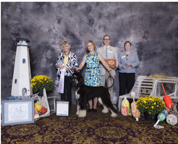
Best of Opposite Sex Sweepstakes Paladin Sweet Tart of Spice Hill