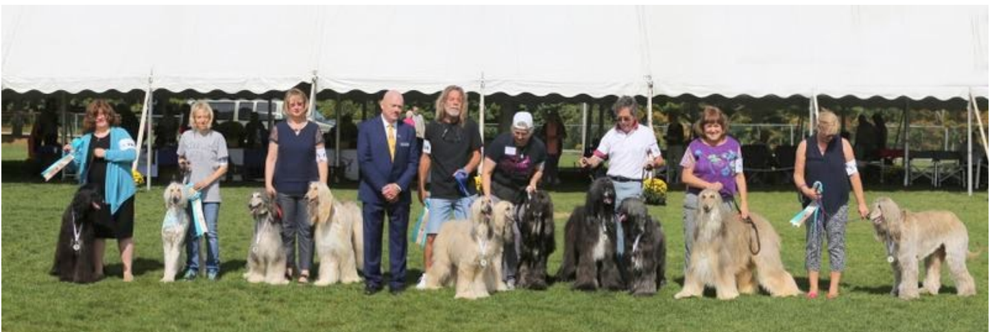
The 2016 Parade of Rescues at the National