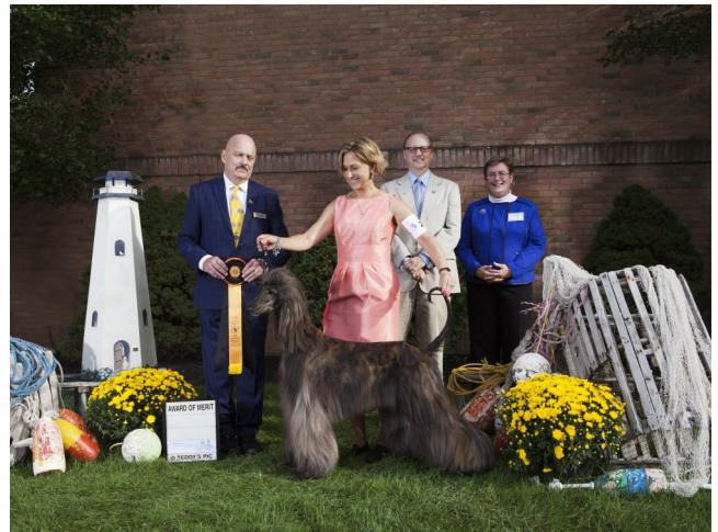
Award Of Merit Ch. Genesis Debutante of Spice Hill

Editors Note: Pictures of the remaining Awards of Merit GCh. Xandali Bon Vivant , GCh. Pahlavi Itz Not My First Rodeo , and GCh. Exquisite Beaujon's Stellar Night were not available from the photographer.