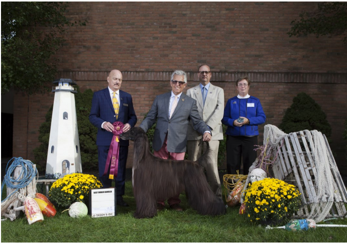
NOHS BOB and Award of Merit Ch. Zircus Of Dega Afghans