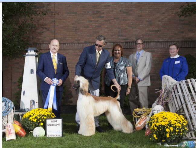
Best of Winners, Winners Dog, and Best In Sweepstakes Lafara's Rockin on the River

As in all things the best is saved for last. In keeping with this practice the last day was the grand finale, Best of Breed. Leading up to the final competition was the Parade of Rescue Dogs and the Parade of Veterans. These events paid tribute to the senior citizens of the breed and honored the ones that have found their forever homes. As their biographies were read and each did a turn around the ring there was enthusiastic applause and cheers from ringside.