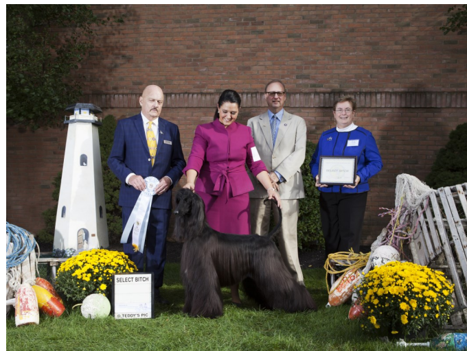
Select Bitch GCh. Sunlit's Queen of Everything