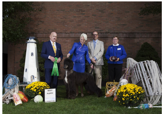
Best Puppy Sura Spring Fever