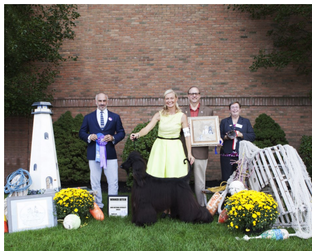
Winners Bitch Luu-Luu Aswad Bint Benazir Von Haussman