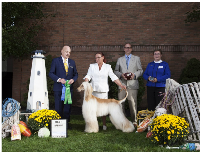
Best BBE Klacic Fast And Furious O Rustic

Driving through the rain on Monday morning, September 19 th to the Afghan Hound Club of America's 80 th National Specialty show in Warwick, RI, got me thinking about the very first National I ever attended - 1956 - at the Henry Hudson Hotel in New York City - surely a long time ago! And historic as well, as it was the first time a bitch (Ch. Lala Rookh of Estioc) won the National. Wow! Sixty years have flown by since I first saw our beloved breed in its showcase National.