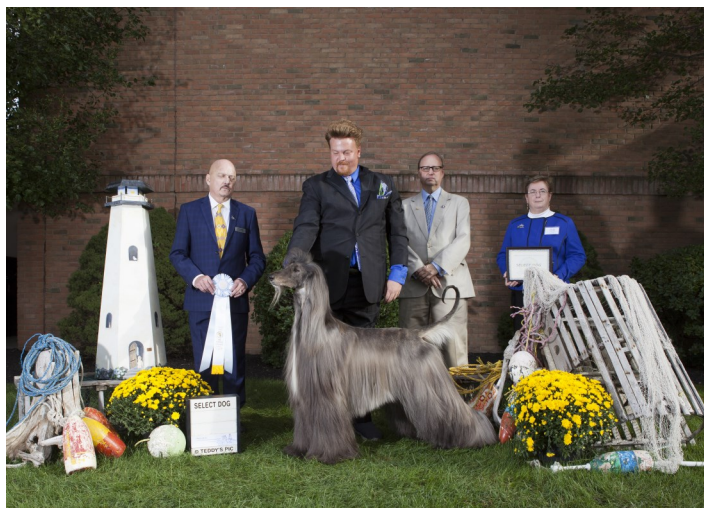
Select Dog GCh. Maja In It To Win It