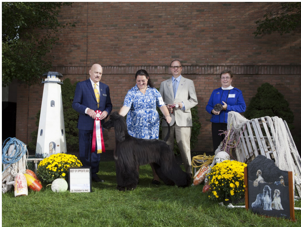
Best Of Opposite Sex Ch. Coup D'Etat Throwing Shade