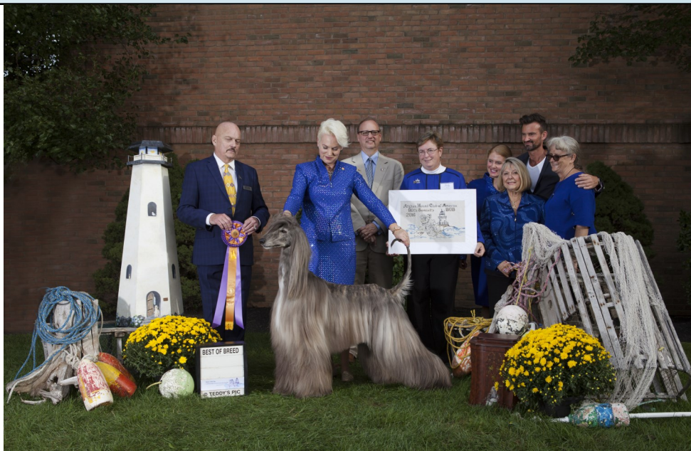
Best of Breed GCh. Agha Djari's Fifth Dimension Of Sura