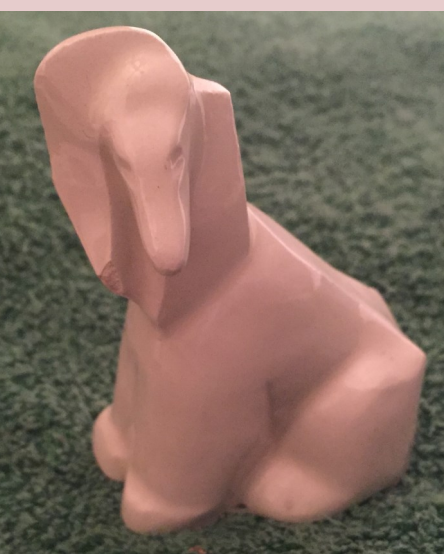
#32 Ceramic Figurine 2 3/8" W x 3 3/8" H