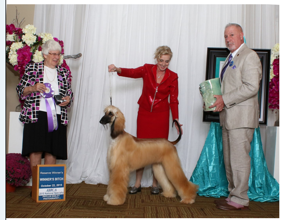
Reserve Winners Bitch: Elan Sebring Price Above Rubies

In our last issue we inadvertently omitted Reserve Winners Bitch in the " Major Awards At a Glance " sidebar. By way of apology we are reprinting the sidebar and including a photo. To be fair, we are also including a photo of Reserve Winners Dog, Best of Opposite Sex in Sweepstakes and Best Puppy.