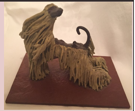
#21 Ceramic Figurine on Wooden Stand 8 5/8" W x 7 ½" H