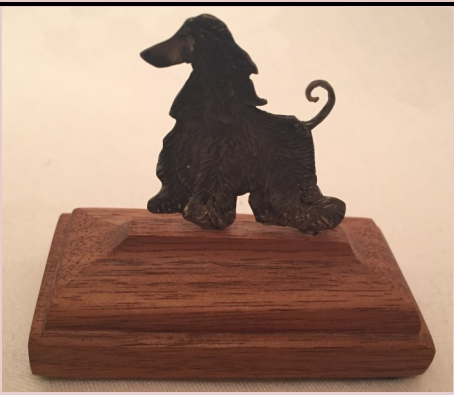
#20 Metal Figurine on Wooden Stand 3" W x 1.5" D