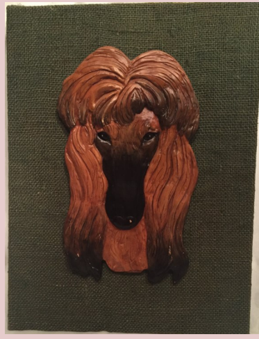
#5. ceramic on green burlap 3dimensional 11 5/8" W x 1' 3 1/2"H