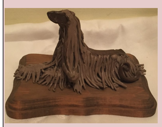
#43 Ceramic Figurine on Wood Base 7 3/6" W x 4 5/8" H