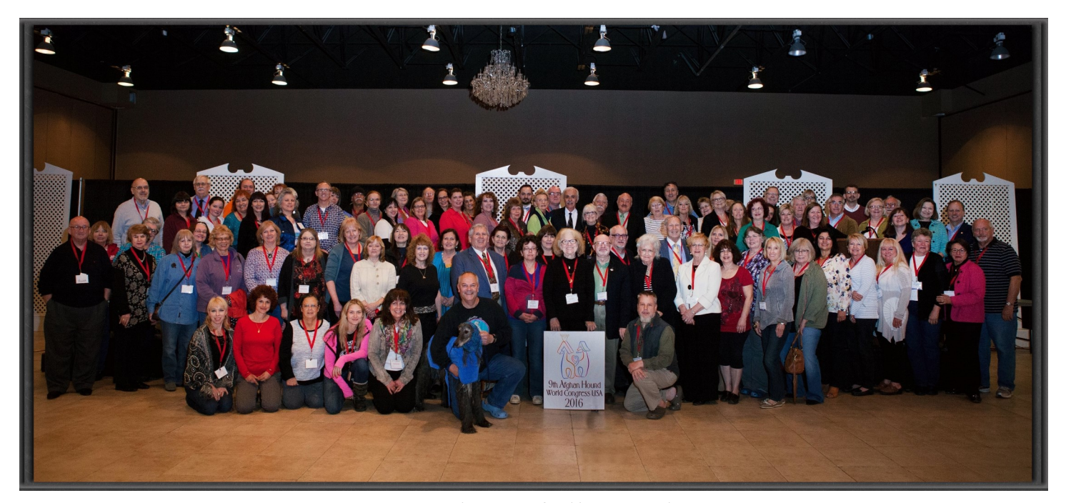
Group Photo of all Attendees

When you're focusing on the major issues in your breeding program, it's easy to forget that your fellow breeders around the world may be struggling with many of the same concerns. That is why attending a World Congress can be so enlightening. To have knowledgeable international fanciers gather to discuss the state of one's breed is an invigorating and eye-opening experience. The 9<sup>th</sup> Afghan Hound World Congress certainly proved to be all of that and more.