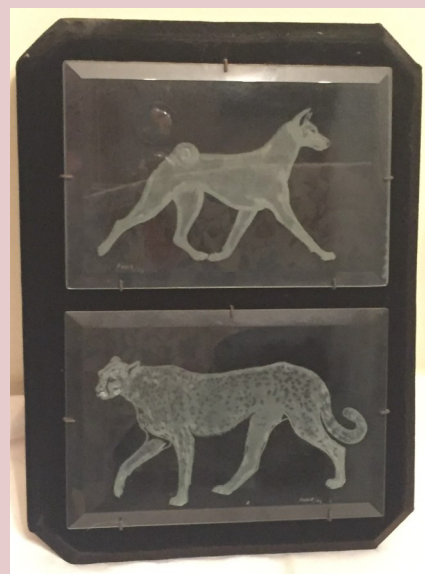
#45 Glass Etchings on Black Velvet 11 1/4" W x 15" H