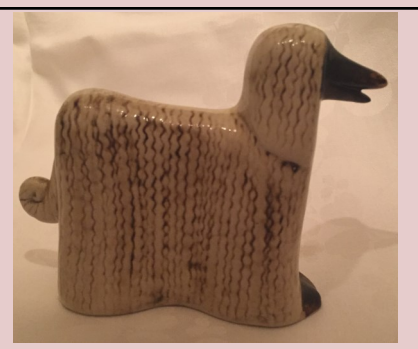
#30 Ceramic Figurine 5 1/2" W x 4 1/4" H