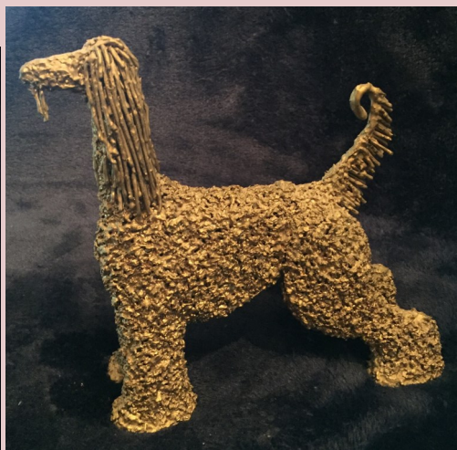
#36 Gold Figurine 7 1/4" W x 6 3/4"H