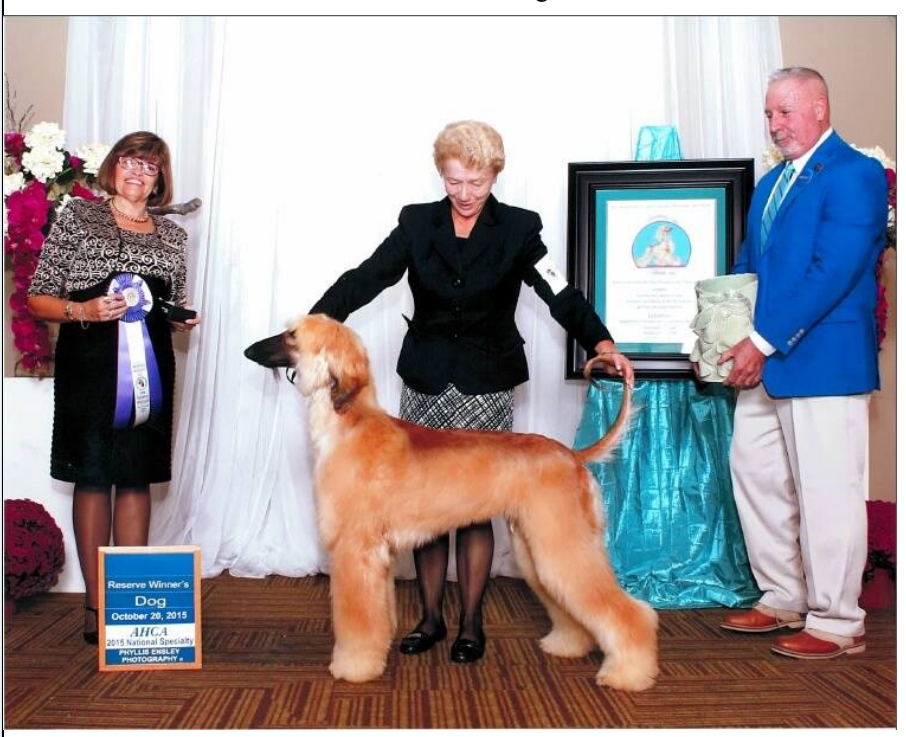
Reserve Winners Dog, Best of Opposite Sex in Sweepstakes and Best Puppy: Sharja Sunset