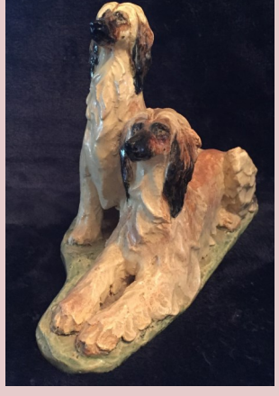
#14Ceramic sculpture by the same artist that does the Queen of England's dogs 9 1/4"W x 7 3/8" H