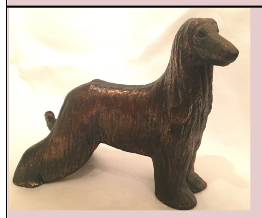
#37 Metal Figurine 8 1/4" W x 6 5/8"H

Lt. Colonel Wally Pede is offering the items pictured on the following pages for sale to the highest bidder. <u>Purchaser will be responsible for shipping.</u>