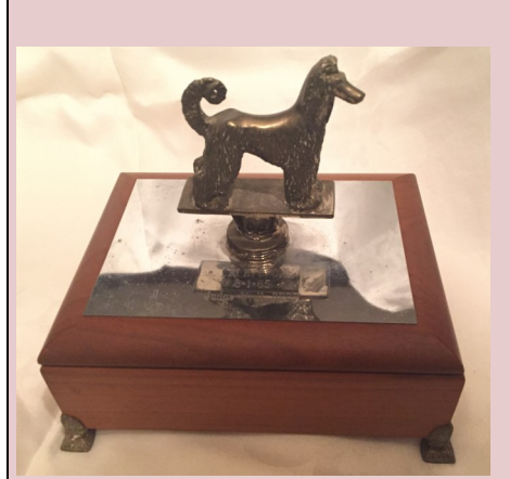
#12 Presented to Col. Pedé from the AHCC 9 5/8" W x 7 ½"D