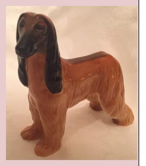
#24 Ceramic Figurine 6 7/8" W x 5 7/8" H