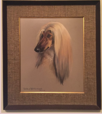
#2. Painting by same artist that painted Queen of England's dogs 1' 8" W x 1' 10" H