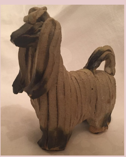
#22 Ceramic Figurine 6 1/8" W x 6 5/8" H