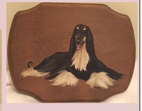
#42 Afghan Painting on Wood 11.5" W x 9 1/8