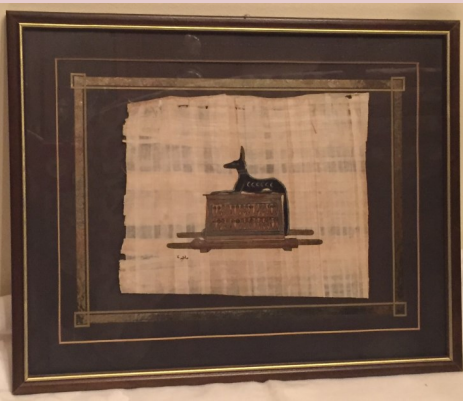
#41 Saluki Painting on Parchment 14 7/8" W x 1' H