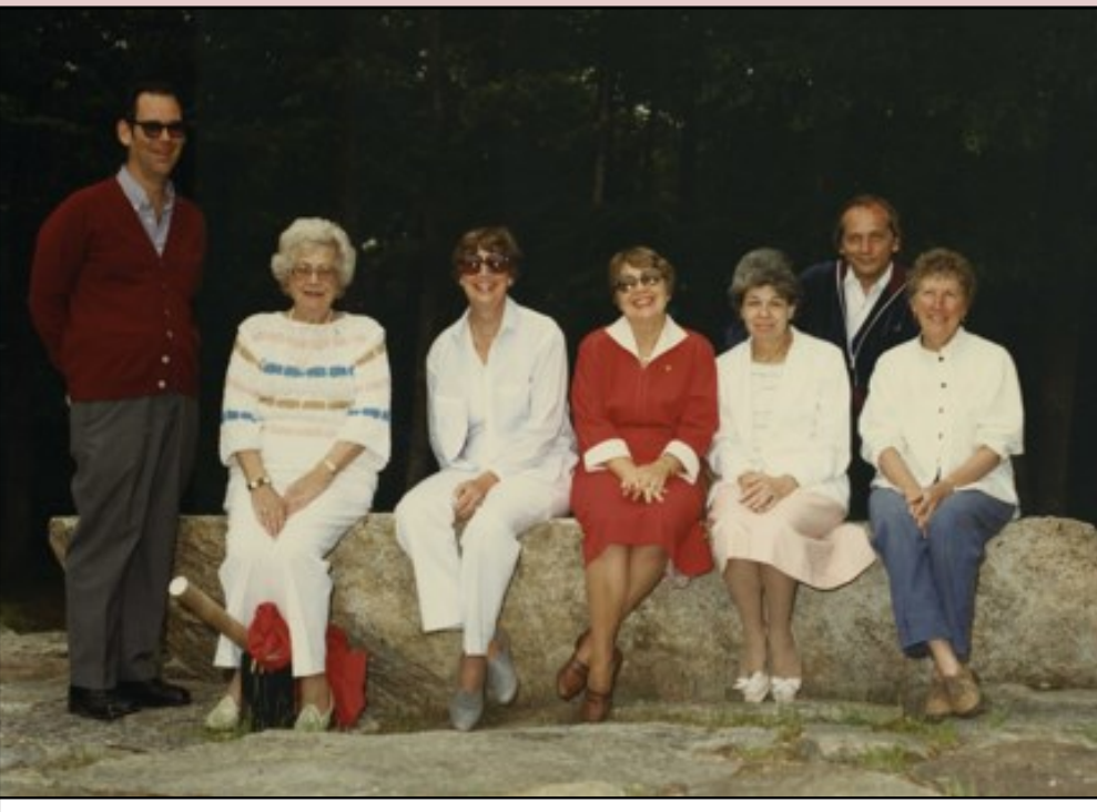
See answer on page 16