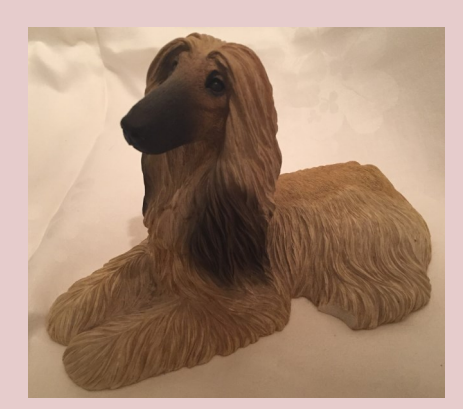
#26 Ceramic Figurine Does have chip 10 3/8" W x 6 3/8"H