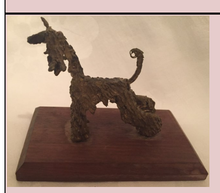
#19 Metal Figurine on Wooden Stand 5 ½" W x 4 ¼" H

Lt. Colonel Wally Pede is offering the items pictured on the following pages for sale to the highest bidder. <u>Purchaser will be responsible for shipping.</u>