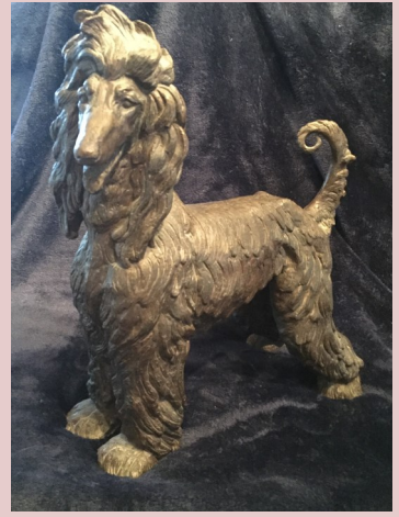
#9 A Kay Finch sculpture HEAVY13" H x 11 3/8" L x 5 3/4" W

Lt. Colonel Wally Pede is offering the items pictured on the following pages for sale to the highest bidder. <u>Purchaser will be responsible for shipping.</u>