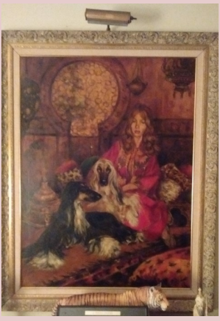
#13 Oil Painting by the owner with her two Afghans 47 1/2" T X 37" W