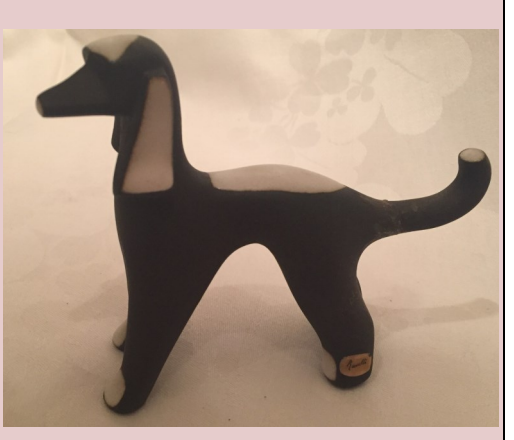
#27 Ceramic Figurine 5 1/8" W x 4 1/4" H