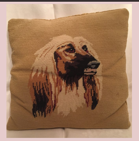
#11 Afghan pillow 12" x 12"