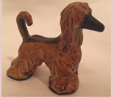
#29 Ceramic Figurine 3 5/8" W x 3 ½"H