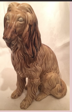
#38 Ceramic Figurine 8 1/4" W x 11"H