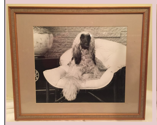
#40 Framed Afghan Portrait 1' 11 1/4" W x 19 7/8" H