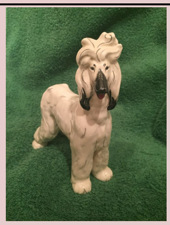
#10 Ceramic Figurine 6 ½" W x 6 ¾" H