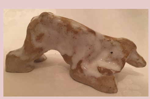
#23 Ceramic Figurine 5 1/8" W x 2 1/8" H