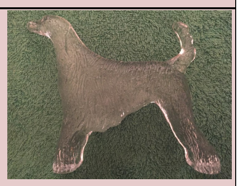
#39 Glass Figurine 6 5/8" W x 5 3/8" H