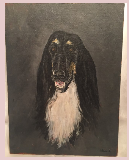
#4. Oil painting on canvas 1' W x 1' 4"H