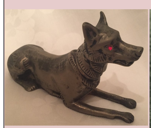
#31 Metal Figurine 6.5"W x 3 3/8"H