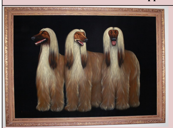
#1. Oil Painting on black velvet 4' 10 ½" W x 3' 11 ¼" H

Lt. Colonel Wally Pede is offering the items pictured on the following pages for sale to the highest bidder. These items are from his personal collection accumulated over his lifetime of involvement with dogs. Bids & questions should be submitted to Lt. Colonel Pede at privatepede@cox.net. 25% of the purchase price will be donated to the Afghan Hound Club of America in honor of Kay Pede. All dimensions are approximate. Purchaser will be responsible for shipping.