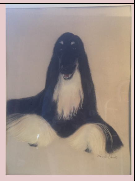
#3. Pastel hand painting 1' 6 3/4" W x 2' 1" H