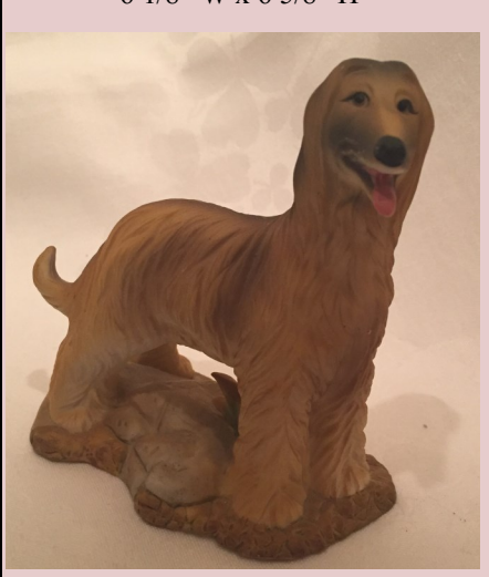
#25 Ceramic Figurine 4 ½" W x 4 ¾" H