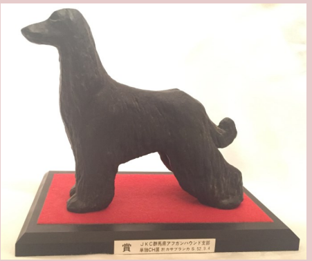
#17 Presented to Col. Pedé on a judging visit to Japan 8 7/8" W x 7 3/8" H