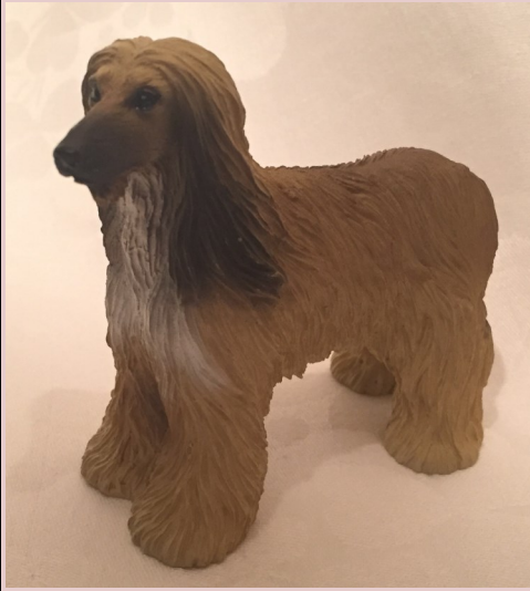
#34 Ceramic Figurine 3 7/8" W x 3 3/4" H