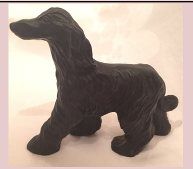
#28 Metal Figurine 6" W x 5" H

Lt. Colonel Wally Pede is offering the items pictured on the following pages for sale to the highest bidder. <u>Purchaser will be responsible for shipping.</u>