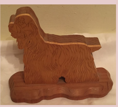
#44 Wooden Figurine 7.5" W x 6" H