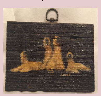
#18 On wood, very unusual wood wall hanging 7 ½"W x 6" H