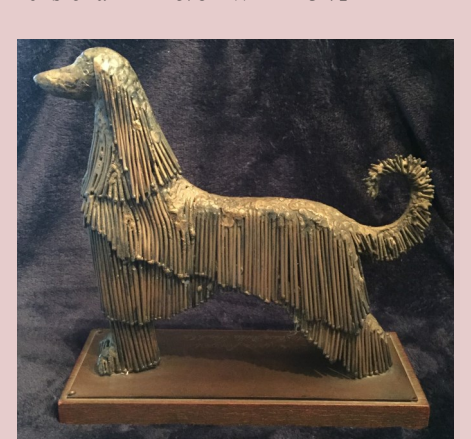
#8. A sculpture presented to Col. Pedé after a judging assignment in Finland in the 50's