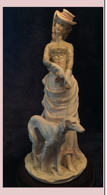
#15 Ceramic sculpture 6 1/4" W x 10 1/4"