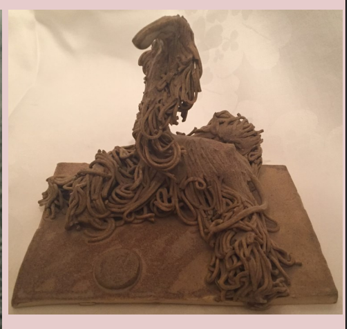
#33 Ceramic Figurine on Wooden Stand 7 5/8" W x 5 3/4"H