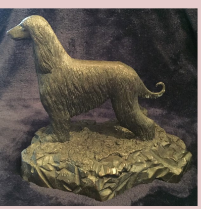
#7. A very realistic sculpture of a Bronze BIS Afghan by a plastic surgeon HEAVY 9" H x 10 1/4" L x 6 1/4" W