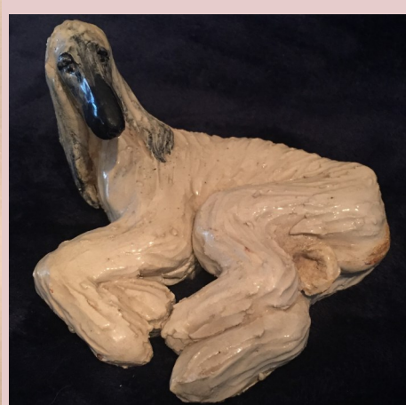
#35 Ceramic Figurine 5.5" W x 3.5" H