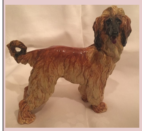
#16 Ceramic Sculpture by artist that does Queen of England's dogs 8 3/8" W x 8 5/8" H