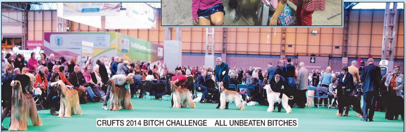
CRUFTS 2014 BITCH CHALLENGE ALL UNBEATEN BITCHES

Visit the AHCA Website at afghanhoundclubofamerica.org Rescue Hotline: 1-877-AF-RESCU (1-877-237-3728)