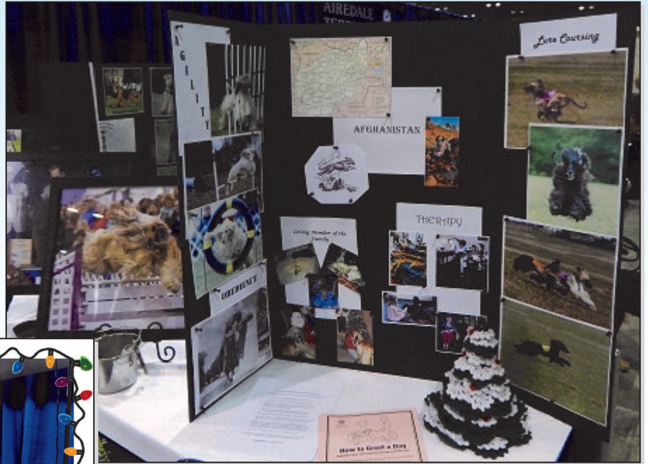
Above - Poster board showing Afghan Hound competing in lure coursing, obedience, agility and therapy.