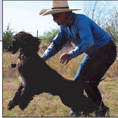
Off and running in 2014 !!!

First, I wish to thank the Members of the Afghan Hound Club of America for placing your trust in me to serve as President for the next two years.